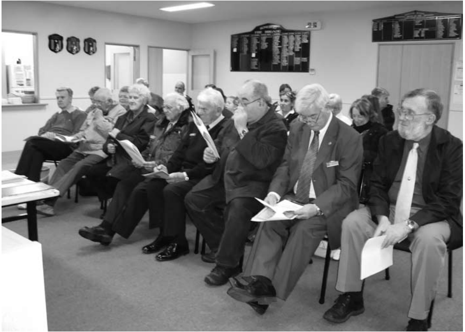
Peninsula Group AGM 17th July 2009