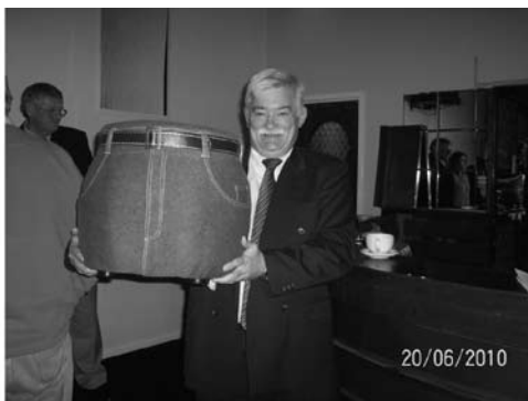
Well, I wouldn't call it a first prize.