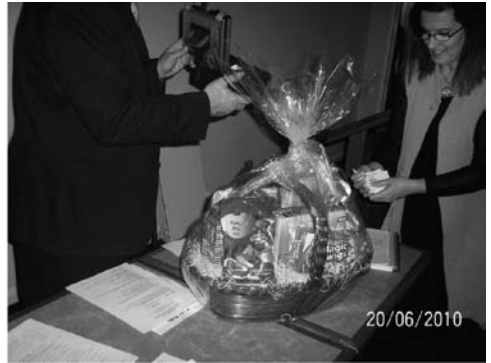
This looks more like a first prize to me.