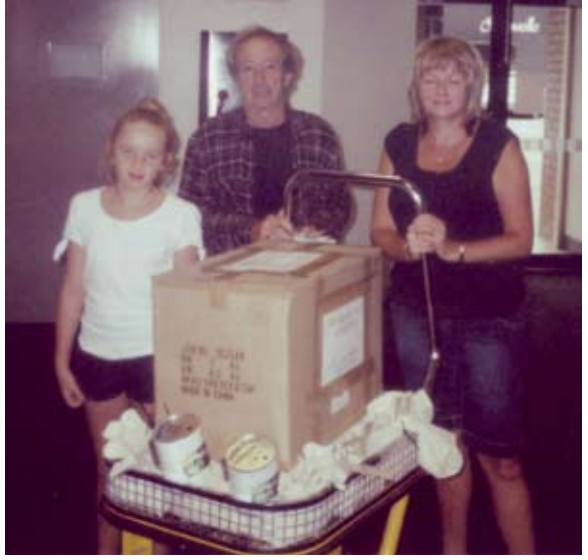
Wheeling some of the West Gippsland Branch cash into the bank on Good Friday