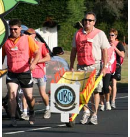
Peninsula Group Barrow Push 2010