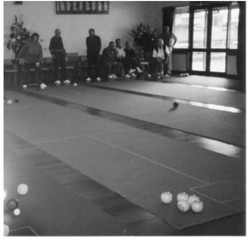
Drouin Bowls - May 2010